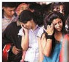
■ Safety of girl students is on UGC's agenda.

The questionnaire is full of queries ranging from the num-